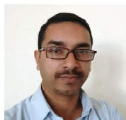
By: M.R. Lahu

India's political spectrum witnessed a complete transformation when an outsider from Delhi with a layman's profile invaded it. Decades of Indian politics was full of powerful transcriptions of dynastic narratives that defined, decoded and at times demonised it in various vernaculars. Narendra Modi's invasion into the political domain of India came with an unprecedented force and it was an unpredicted exercise until a decade ago. And the main reason such an exercise seemed unrealistic and insensitively brushed under the carpet was the political force that controlled India for decades with the power it garnered by playing its political shrewdness on the innocence that India's landscape is inhabited with. The transformation seems to be completely overlooking all narratives effectively erasing the dynastic influence. The desperation of the dynasts and their shenanigans have often been surfacing with an ostensible denial.